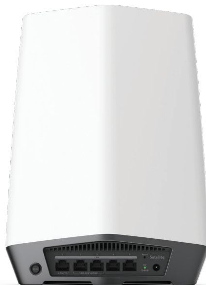
Orbi Pro WiFi 6 Satellite (SXS80)